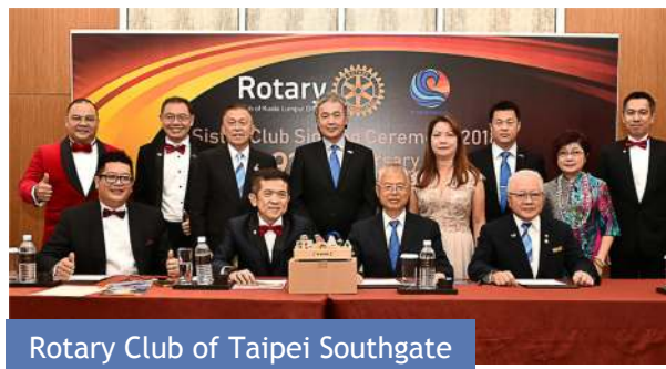
Rotary Club of Taipei Southgate