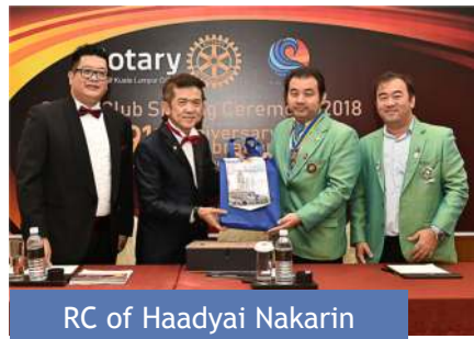
RC of Haadyai Nakarin