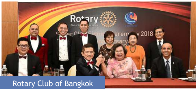
Rotary Club of Bangkok

Our club signed with five Rotary clubs from across Asia Pacific sister club agreements to renew their bond as closely cooperating and heartfelt partners.