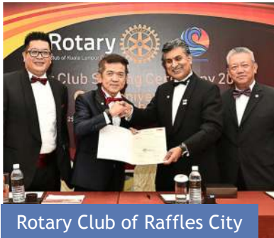
Rotary Club of Raffles City