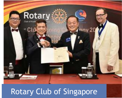
Rotary Club of Singapore