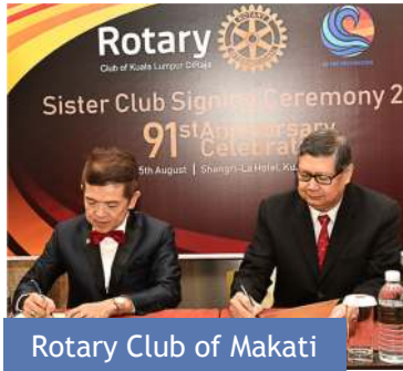
Rotary Club of Makati